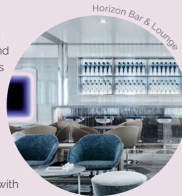
Horizon Bar & Lounge

Fine à la carte dining and sumptuous breakfasts and lunches in the Reflections Restaurant's serene setting take inspiration from the route you will be travelling. Expect fresh, locally sourced dinners, thoughtfully crafted by expert chefs, with complimentary sommelier-paired wine, beer or soft drinks with lunch and dinner*. In the evening, once you've enjoyed your meal, you can head to the back of the restaurant to appreciate the ocean breeze from the large alfresco terrace before a nightcap in the plush, relaxed Horizon Bar & Lounge.